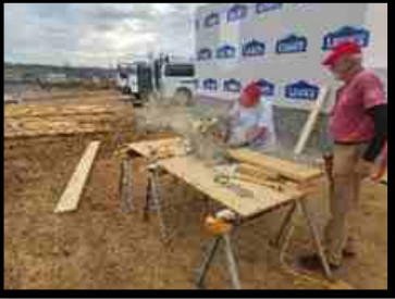
Volunteers from Spring Creek serving in Dawson Springs- March 2024