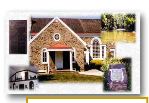
The Germantown Trust

THE GERMANTOWN TRUST BOARD IS RESPONSIBLE FOR THE PROPERTY MANAGEMENT OF THE CHURCH OF THE BRETHREN'S "MOTHER" CHURCH, THE CEMETERY AND THE HOUSE